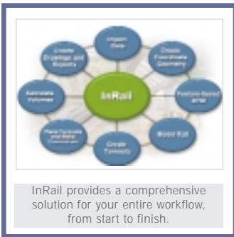
InRail provides a comprehensive solution for your entire workflow, from start to finish.